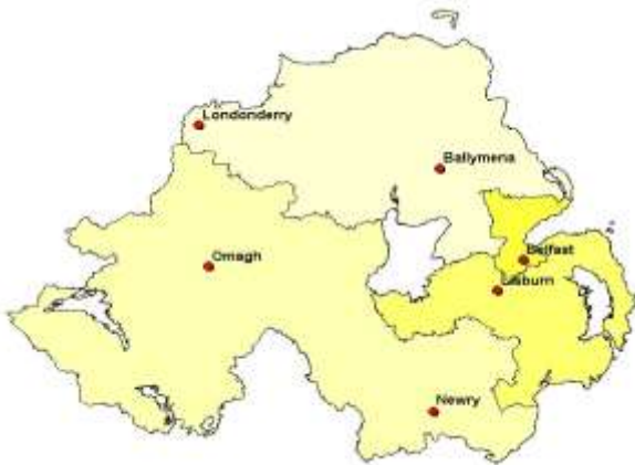
PPS Office Locations

The PPS has six regional offices, known as ‘Chambers’. An additional Belfast office, Linum Chambers, accommodates various Corporate Services functions and the Belfast office of the Victim and Witness Care Unit.