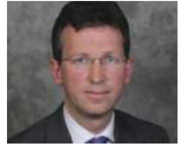
Jeremy Wright QC MP

An independent prosecution service like the PPS is central to a fair criminal justice system. Prosecutors need to prosecute without bias with the aim of delivering justice in every case, taking decisions independently and without fear or favour. Independent prosecutors, taking their decisions against clear evidential and public interest criteria, help build confidence in the criminal justice system.